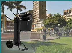
Aero one for large area upto 1 acre