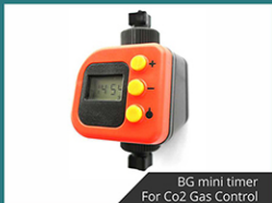
BG mini timer For CO 2 Gas Control