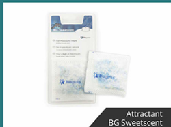
Attractant BG Sweet scent