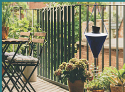
BG Mosquitito for Indoor / Outdoor Use